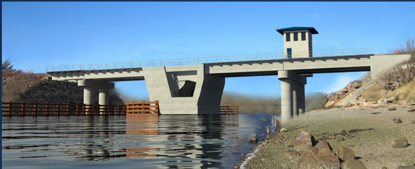
GLOUCESTER DRAW | BRIDGE NO. G-05-028 | GLOUCESTER, MA PHOTOSIMULATION OF PROPOSED BRIDGE