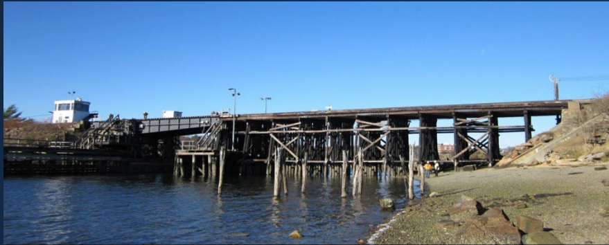
GLOUCESTER DRAW | BRIDGE NO. G-05-028 | GLOUCESTER, MA PHOTOGRAPH OF EXISTING BRIDGE