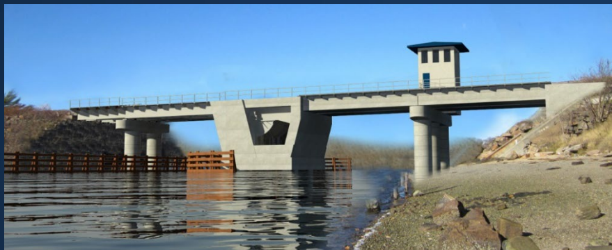
GLOUCESTER DRAW | BRIDGE NO. G-05-028 | GLOUCESTER, MA PHOTOSIMULATION OF PROPOSED BRIDGE