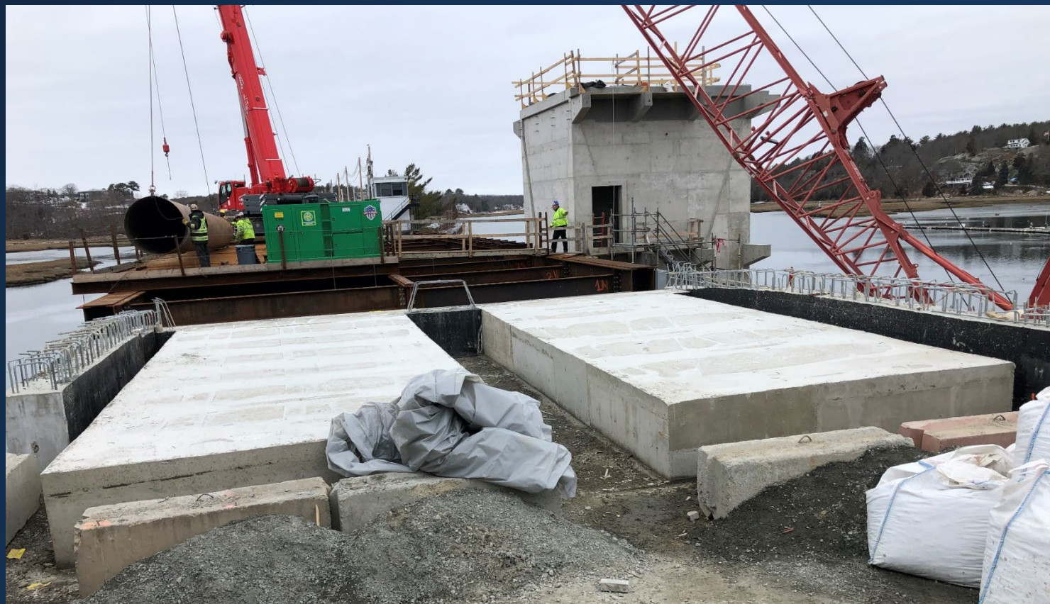
Completed approach slabs at east abutment