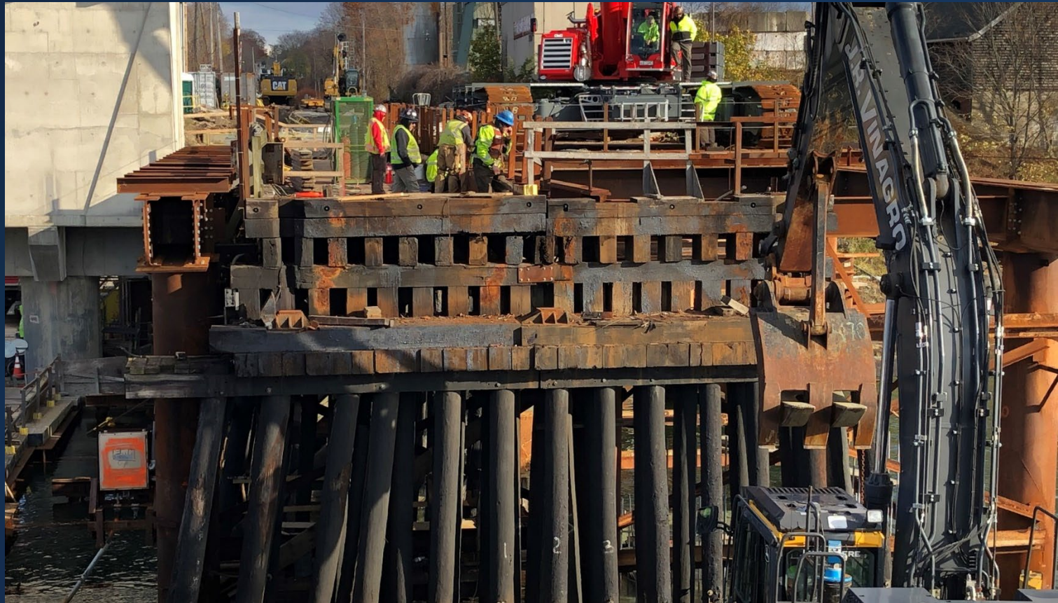
Demolition of existing timber trestle